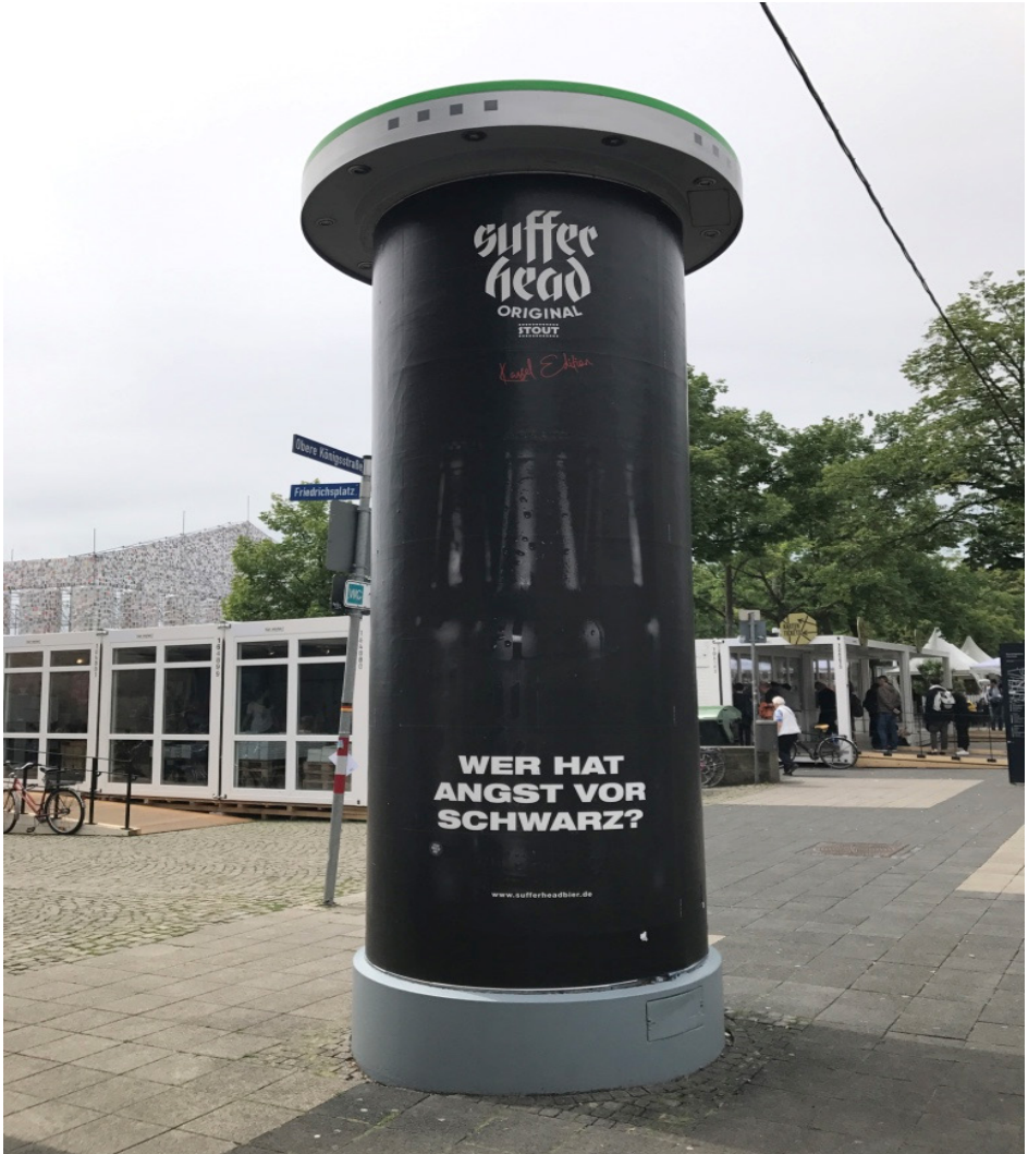
Figure 5 Advertisement billboard for Emeka Ogboh's Sufferhead Original beer in Kassel.