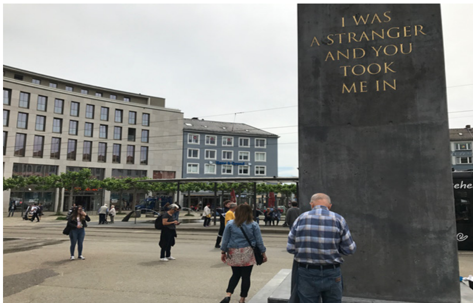
Figure 4 Olu Oguibe's Monument for strangers and refugees (2017), Königsplatz, Kassel.

A different, equally ambivalent, and yet provocative artwork that was much discussed at documenta (and in 2018 also in Berlin's Galerie-Wedding) is artist Emeka Ogboh's dark and strong stout beer Sufferhead Original , which he promoted all over Kassel with a difficult albeit humorous reference to the fear for the dark or black (advertisements, for instance, asked 'Wer hat Angst vor Schwarz?'). I discussed Ogboh's works with documenta14 curator-at-large and founder of SAVVY Contemporary, Bonaventure Ndiukung, for whom the artist was "using this beer not only as a possibility for people to drink, but also using the beer