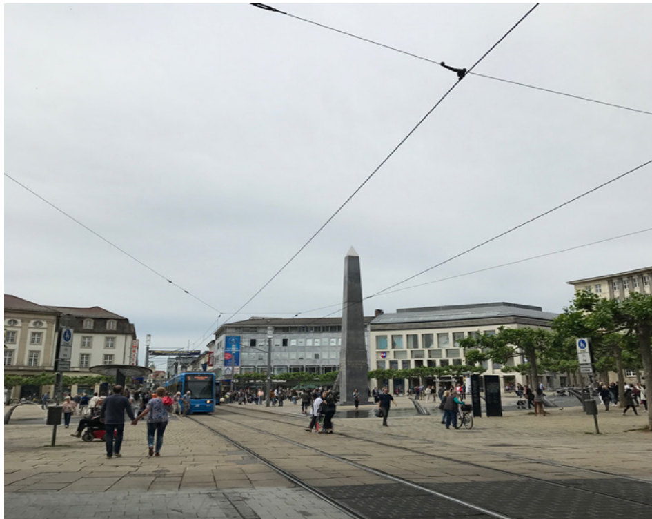
Figure 3: Olu Oguibe's Monument for strangers and refugees (2017), Königsplatz, Kassel.

but, as others responded, was also creating a platform for combining an engagement with questions of migration, hospitality, and alterity with those of contemporary colonialisms. Some of these debates revolved around the sculpture of that year's Arnold Bode documenta14 award-winner Olu Oguibe's Monument for strangers and refugees (2017),