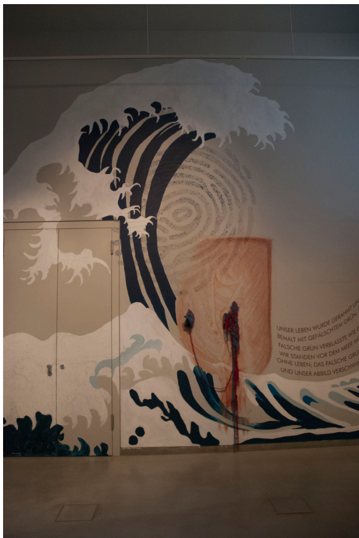
Figure 1 Kunstasyl's exhibition daHEIM: Einsichten in flüchtige Leben at the Museum of European Cultures.