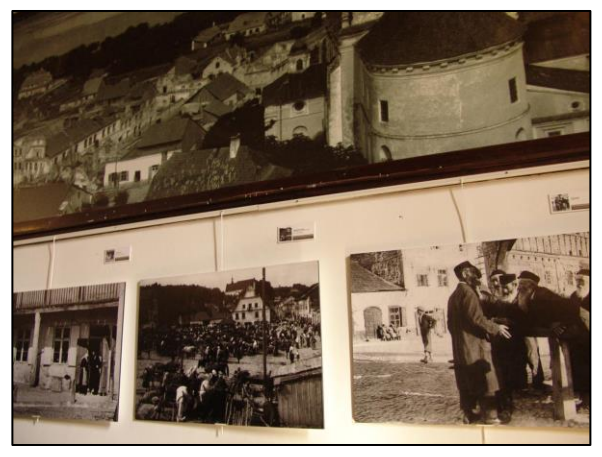
Lublin Kazimierz Dolny