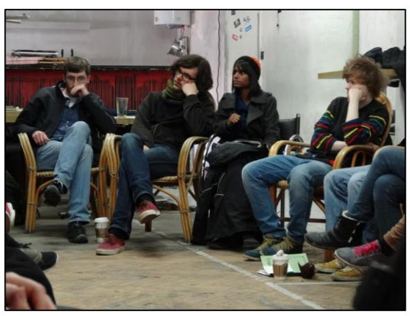
Conference Part III