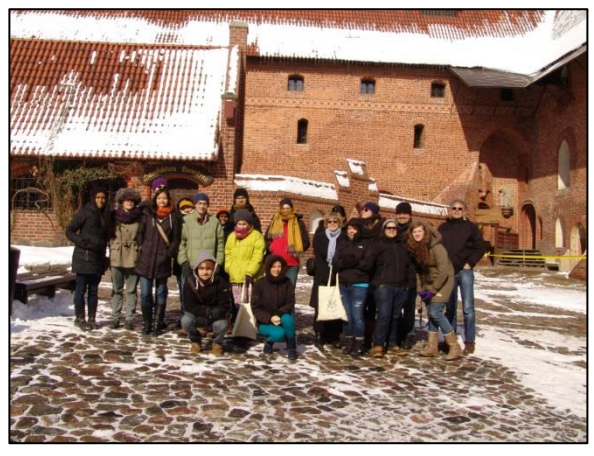
Marlbork Jedwabne Memorial