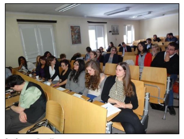
Conference Part I