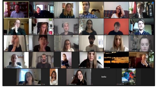
Virtual Student Conference