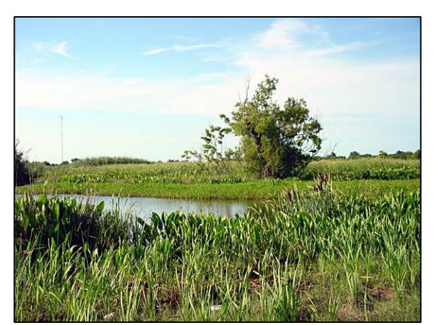
Mississippi Delta (planned visit)