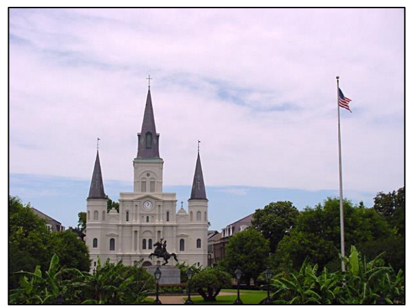
New Orleans (planned visit)