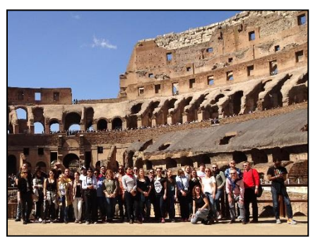
Inside the Roman Colosseum (2017)