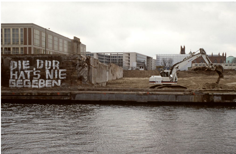
Figure 3: site of the Humboldt Forum under construction