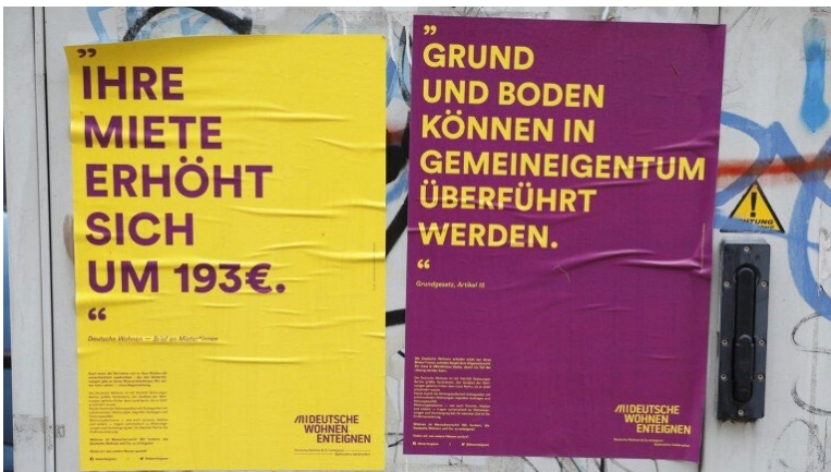
Figure 4: Plebiscite campaign posters